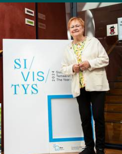
Tarja Kaarina Halonen, former President of Finland